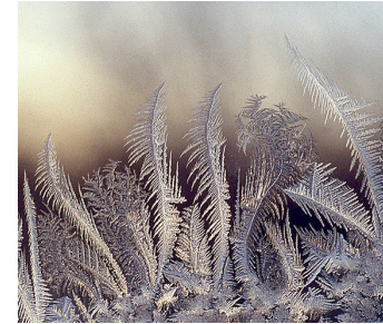
Right | frost and ice forms

Through my animation, I wanted to tell a story about my creative process and who I am as a designer. In the beginning, there is the birth of an idea and my name identity is split open to reveal its contents. We follow the lines in space as the idea is growing. The idea exits the space and enters the world to find inspiration. The idea finds pieces existing in nature and makes it new with the ice texture. The lines and ice build in intensity as the idea grows. In the end, the idea locks into place and reveals my name, pushing away any clutter the ice may have left.