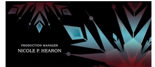
Frozen end credits | Disney